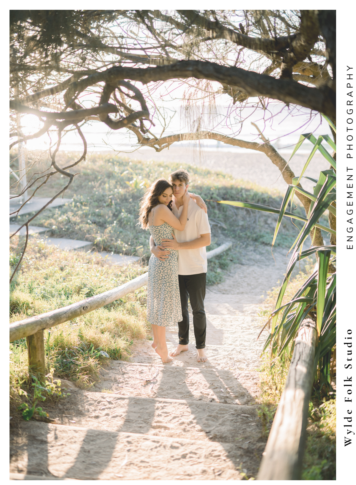
Wylde Folk Studio